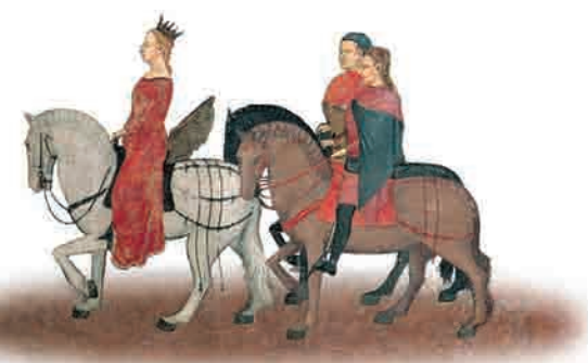
Jacket illustration: Good Government in the City, 1338–40 (detail) (fresco), Lorenzetti, Ambrogio (1285–c.1348) / Palazzo Pubblico, Siena, Italy